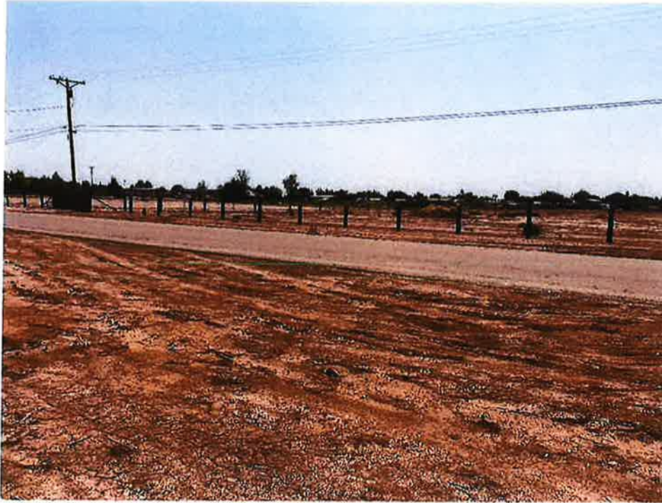
Belford Facing East