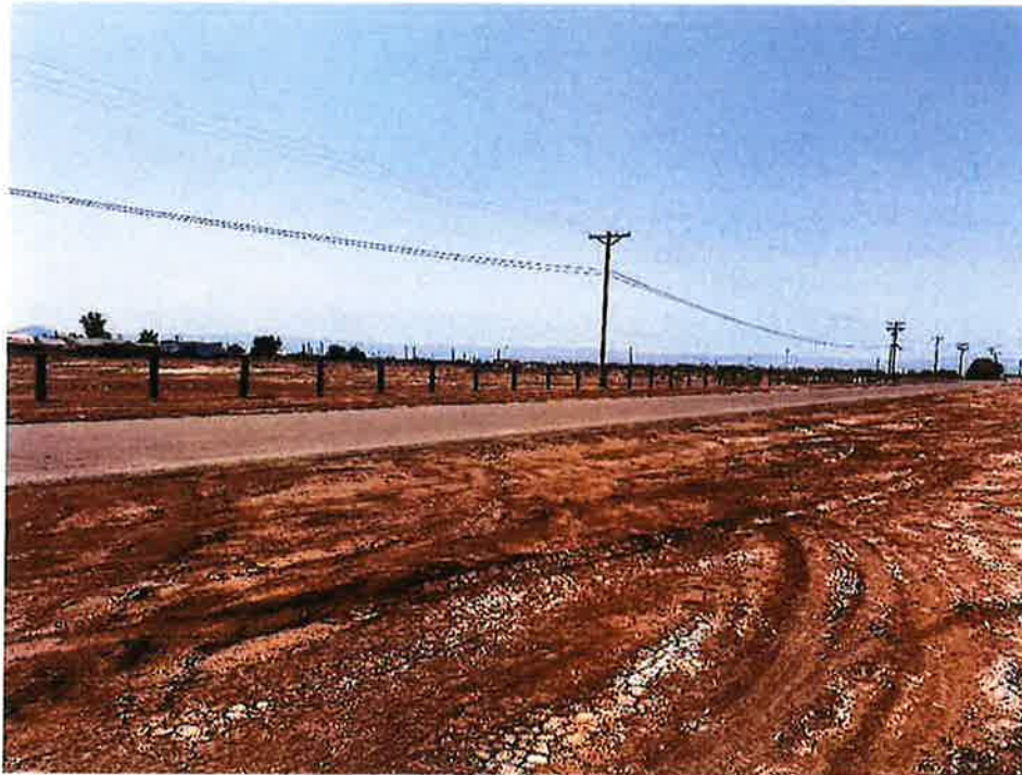
Belford Facing West