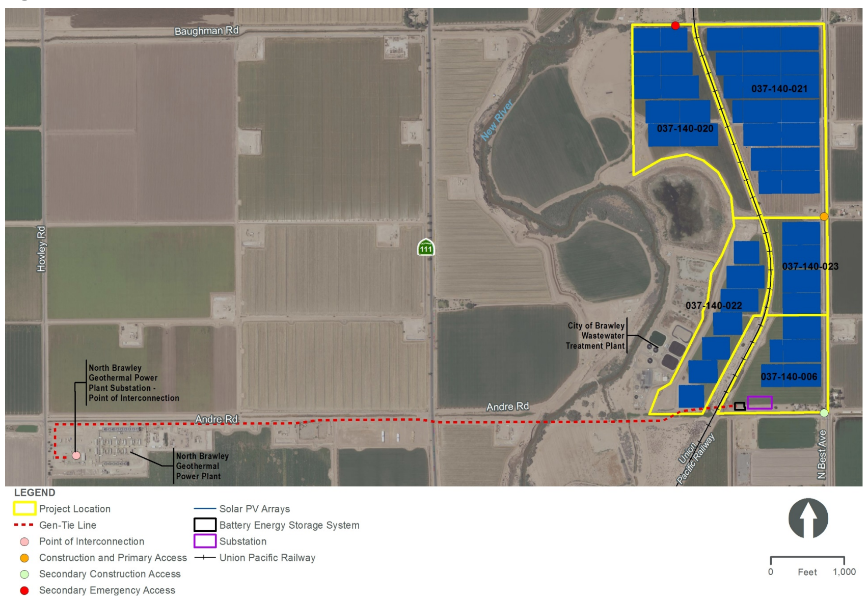
Figure 2-3. Site Plan