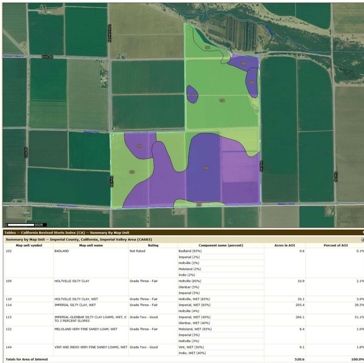
Figure 3: Iris Solar Farm Soils Map