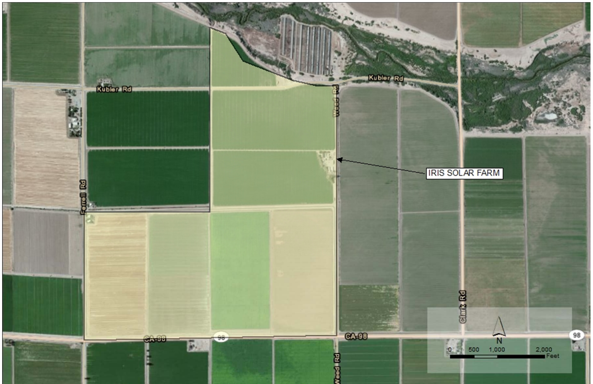
Figure 2: Iris Solar Farm on an Aerial Photographic Base