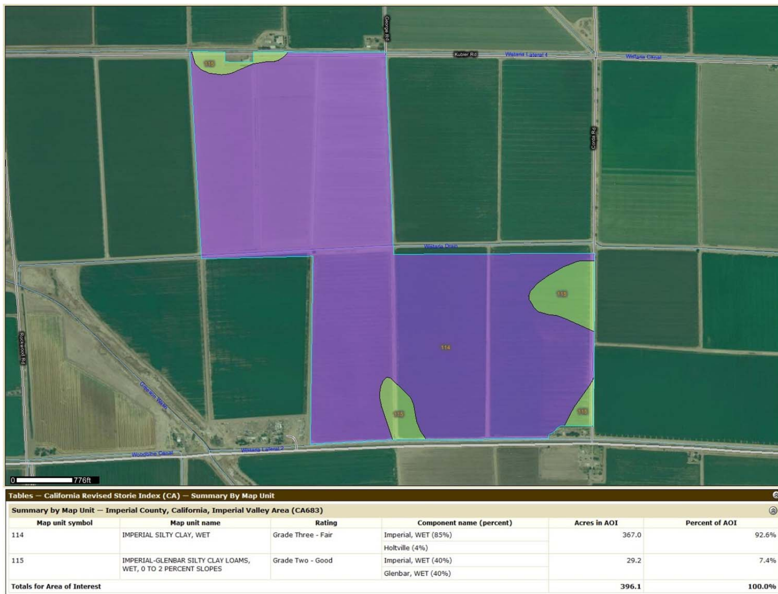
Figure 3: Rockwood Solar Farm Soils Map