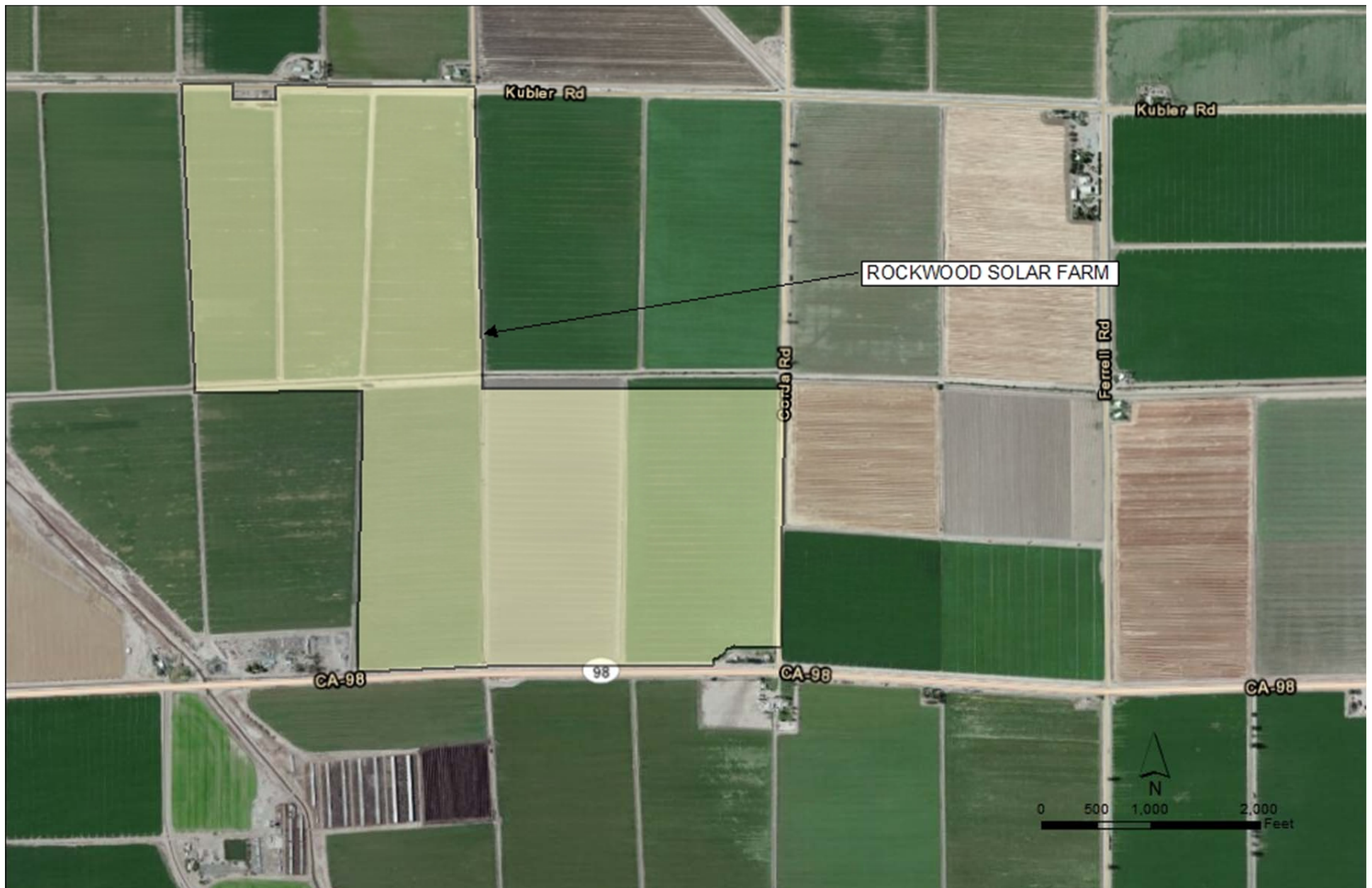
Figure 2: Rockwood Solar Farm on an Aerial Photographic Base