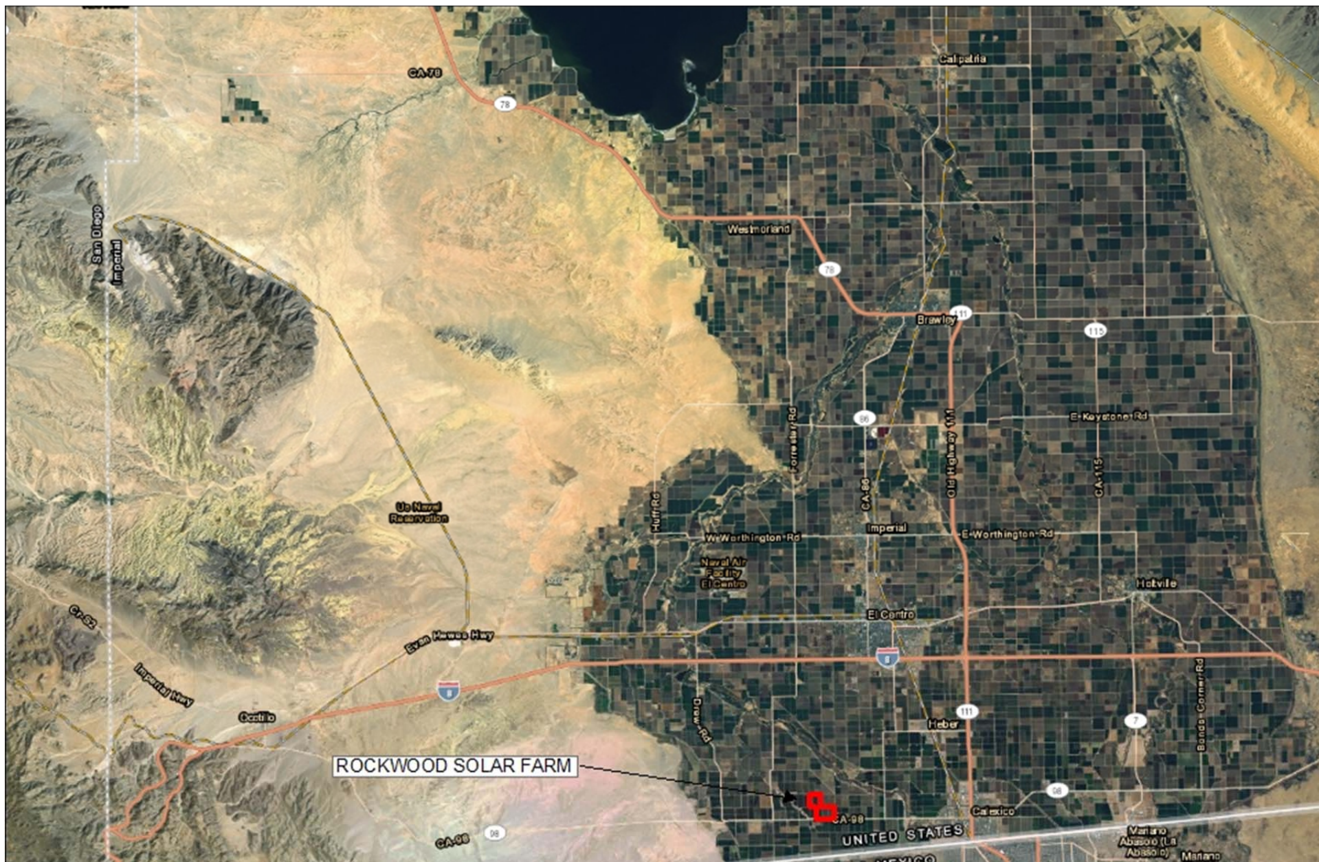
Figure 1: Location Map