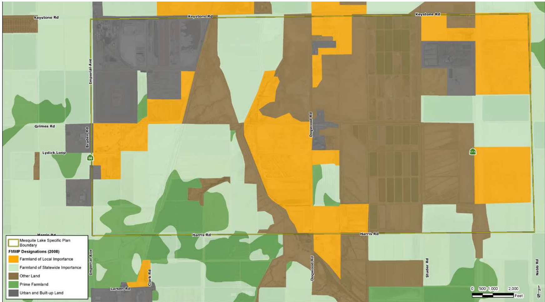
Figure 8.0-3. Alternative 4: Alternative Location – Privately Owned, Non-Agricultural Land