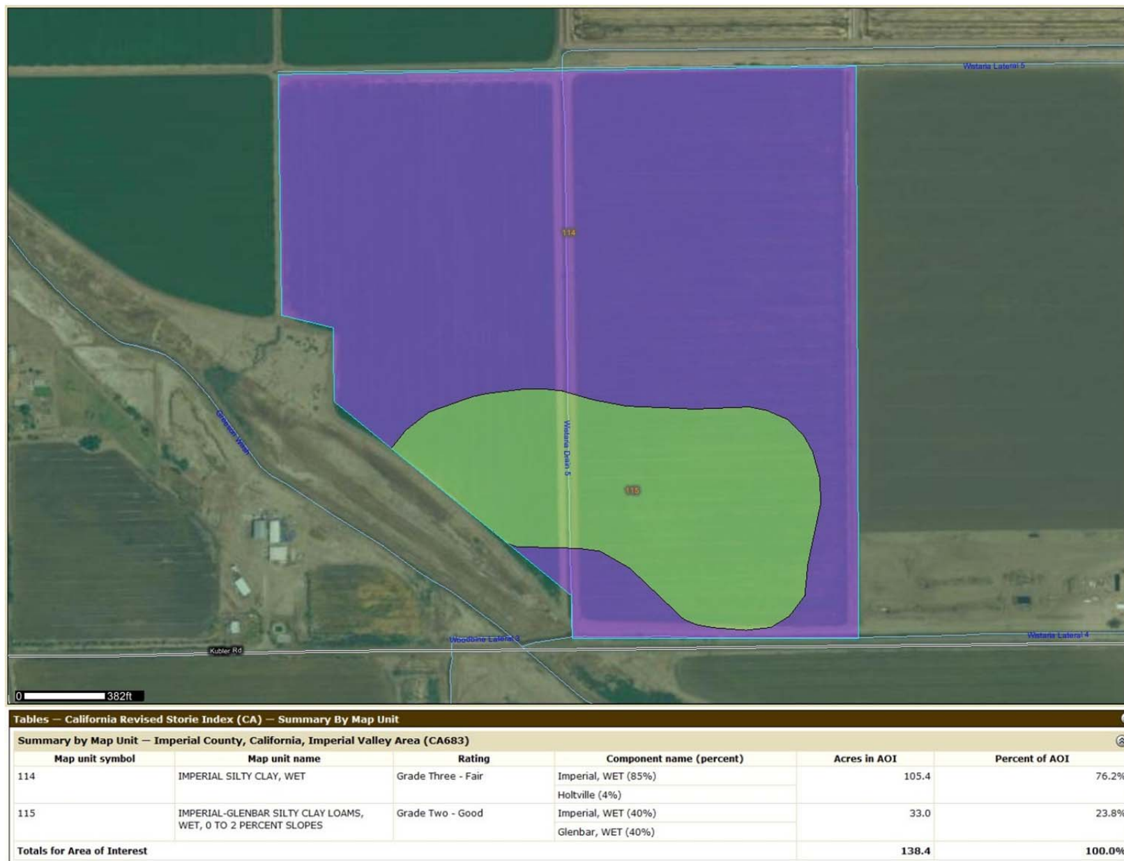
Figure 3 : Lyons Solar Farm Soils Map