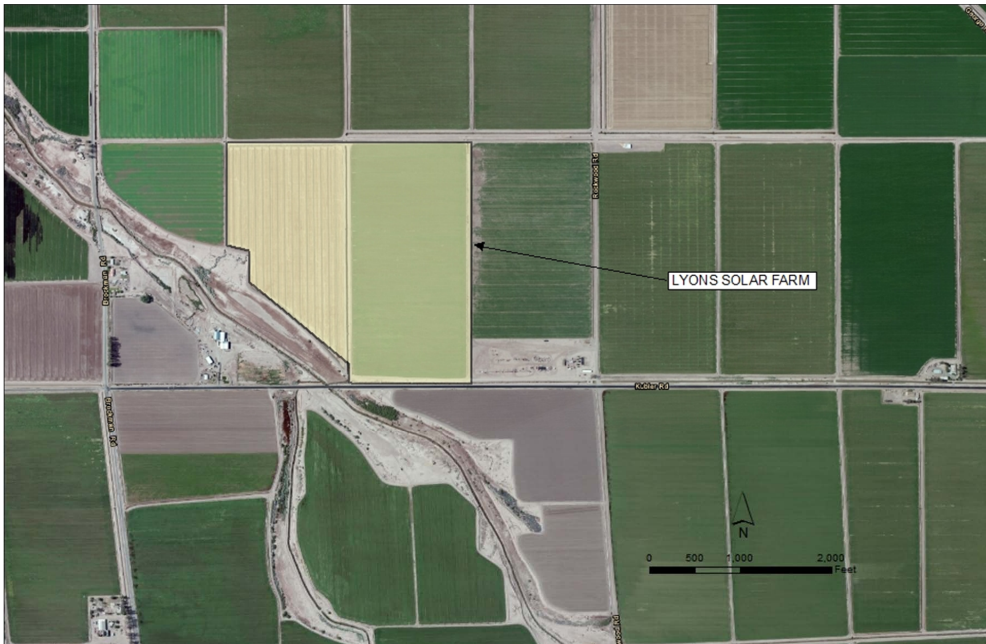
Figure 2: Lyons Solar Farm on an Aerial Photographic Base