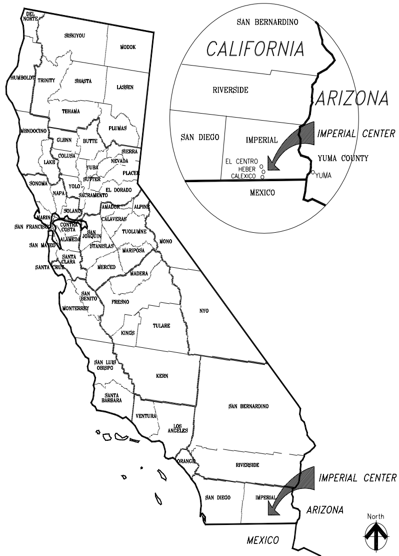
Figure 2-B Regional Location Map

Development Design & Engineering Inc. has worked with Suilo Inc. to develop the Imperial Center Specific Plan .